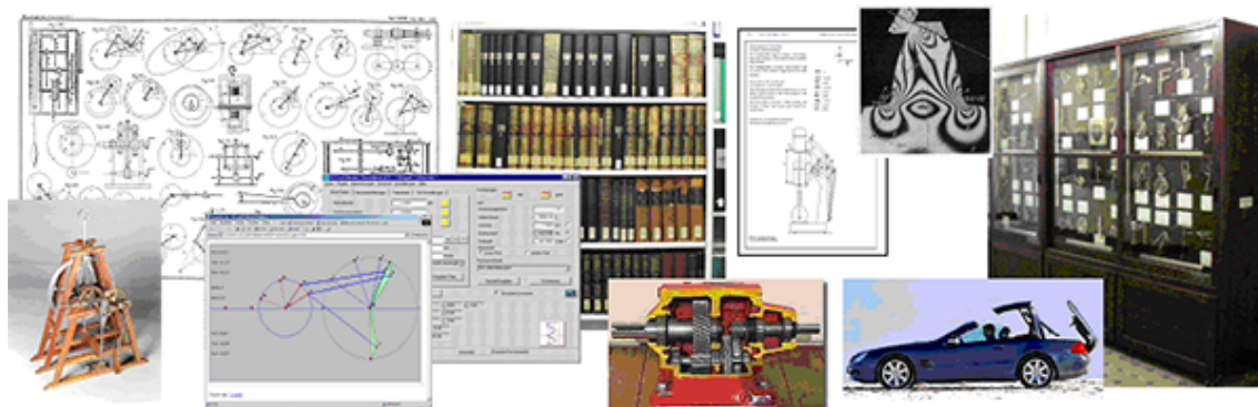
Sources of the DMG-Lib

documents, images and animations, but also on digitalized functional models. Thousands of such unique models exist, with no or only very limited access for the public. This huge amount of available heterogeneous information resources in the DMG-Lib combined with innovative multimedia applications and a semantic information retrieval environment implies a key challenge of this project: the implementation of an efficient, uniform and user-satisfying information retrieval.