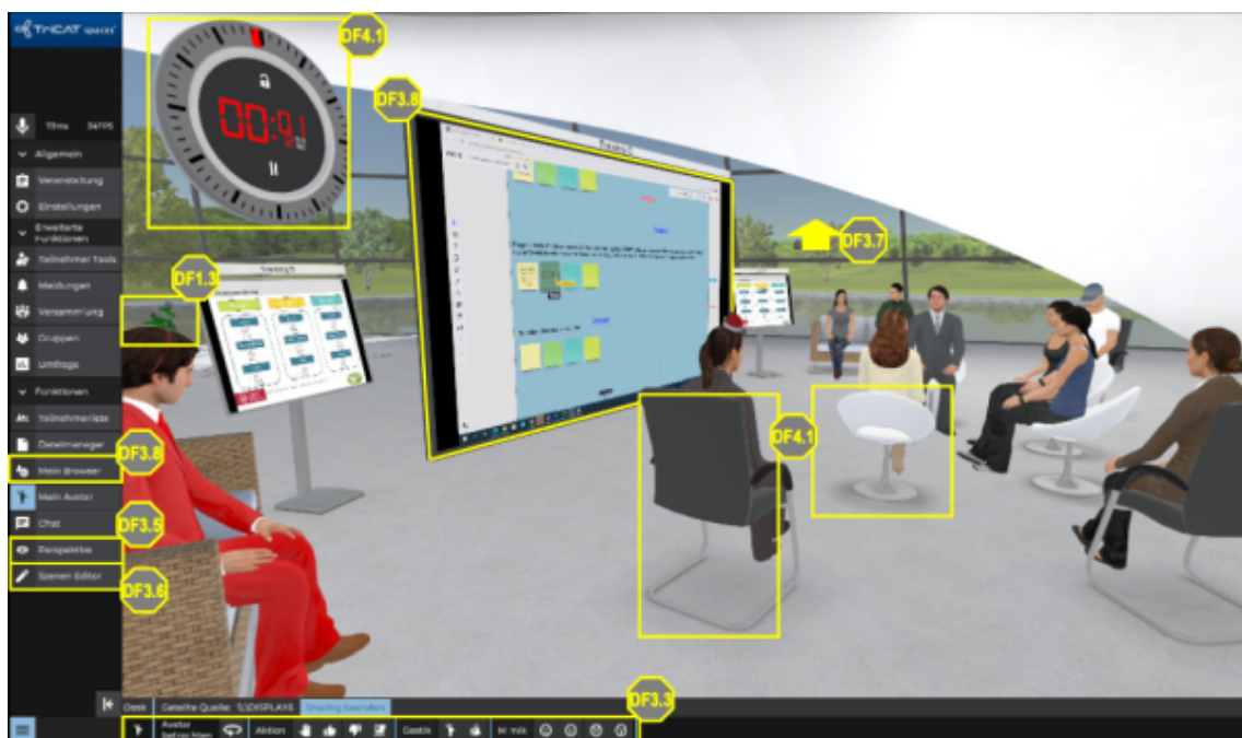
Figure 2. Course Setting in VW with attributed Design Features

Figure 2 shows a screenshot of the original course setting with students sitting on the chairs in the virtual fishbowl. It illustrates some of the design features introduced in this section.